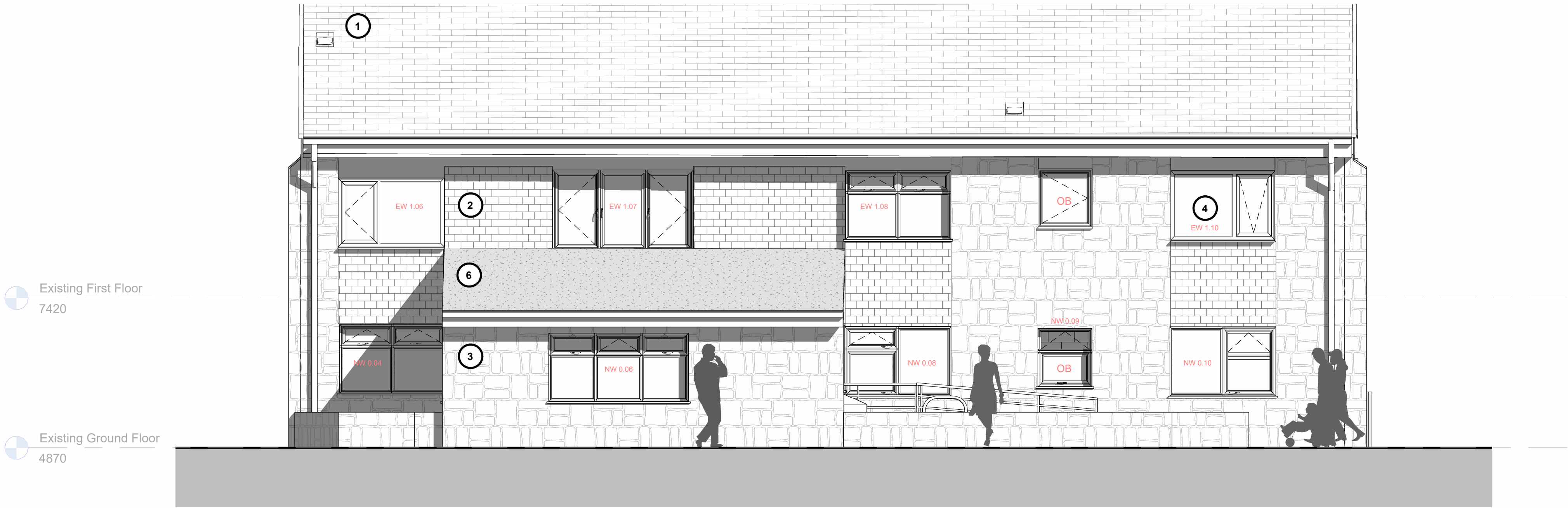
North Elevation - No Changes